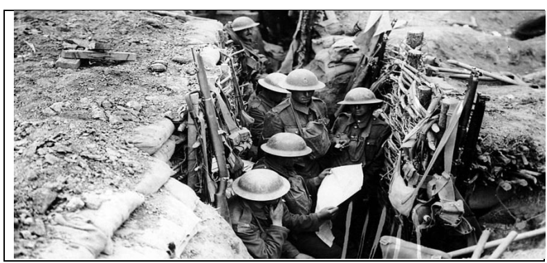
[Soldiers in a First World War trench, 1916]

Use Sources A, B and C above to identify one similarity and one difference in the use of tactics in battle over time.