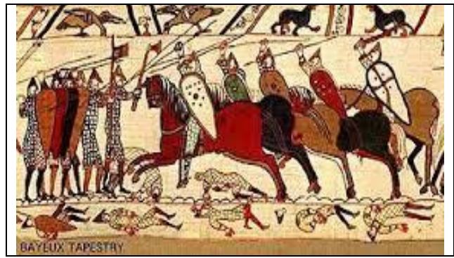
[Soldiers fighting at the Battle of Hastings in1066]